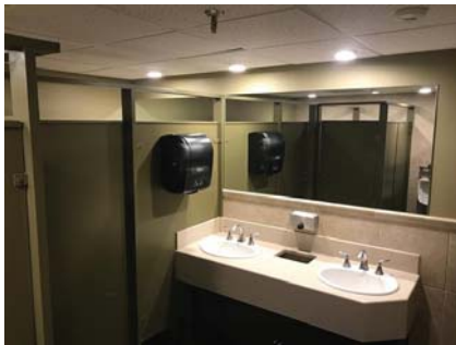
Lobby Bathroom Remodel

Furniture in the fire pit area was replaced with new chairs and couches to give the area a fresher look and feel.