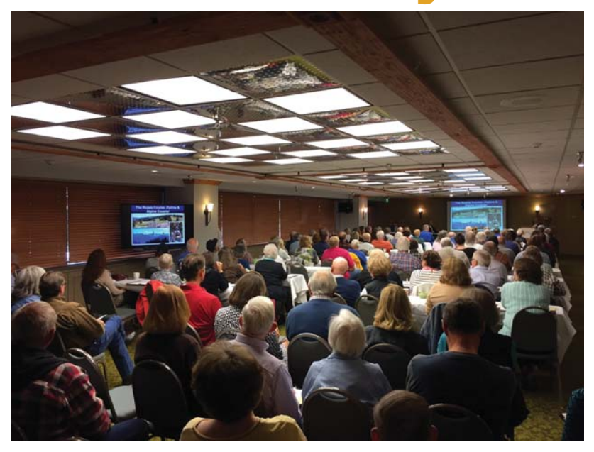
2017 Christie Lodge Annual Owners Meeting

This year the Annual Owners Meeting will be held at Radisson Hotel Fort Worth North-Fossil Creek, located at 2540 Meacham Blvd, Fort Worth, Texas. The meeting will be on Saturday, September 30, 2017, starting with registration and breakfast at 8:30 a.m. The meeting will be called to order at 9:00 a.m.