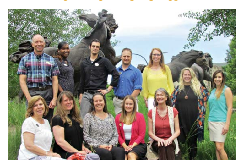
Vacation and Owner Services Team

The Vacation and Owner Services team is here to help you!